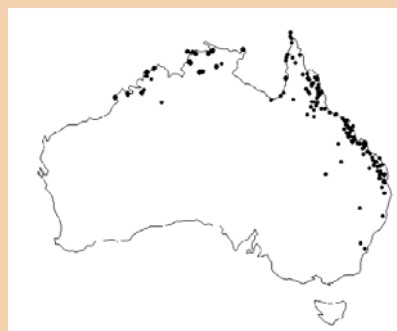
Current distribution of grader grass ( Themeda quadrivalvis ) in Australia, as determined from database records of the species (Source: Queensland, New South Wales, and Northern Territory Herbariums, and Australian Virtual Herbarium: http://www.chah.gov.au/avh ).

Grader grass prefers disturbed areas such as drainage lines, fire breaks, tracks and roadsides, degraded and/or heavily grazed pastures, frequently burnt areas, slashed areas and around cattle camps and watering points. These areas provide entry points