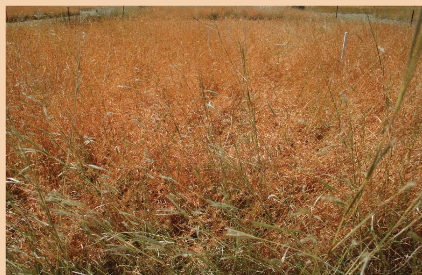
Top: Native pasture spelled for two wet seasons resulting in significantly lower grader grass biomass. Bottom: Native pasture heavily infested with grader grass following frequent burning.