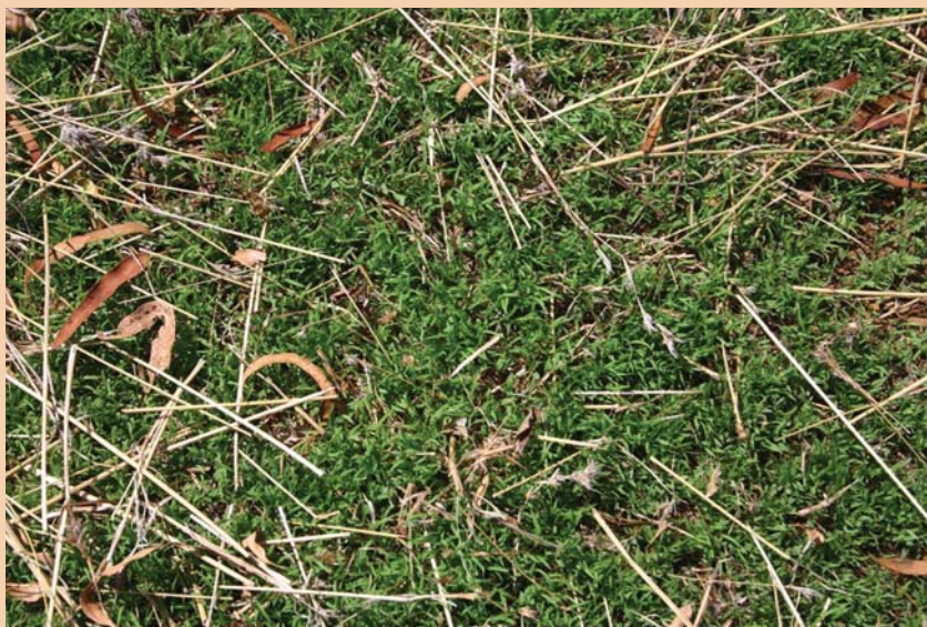
Mass Grader Grass seedling emergence following a single rainfall event in Dec 2006.

Seed can germinate throughout the year as long as temperature, light and moisture conditions are suitable. Seeds germinate best under high light conditions at temperatures between 20 and 30°C. Seed will germinate in darkness (buried) and at temperatures outside this range if sufficient moisture is present. Smoke does not appear to stimulate germination.