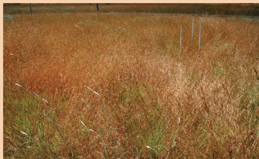
Top: Native pasture sprayed annually for two years with paraquat prior to seed set resulting in reduced grader grass biomass. Bottom: Native pasture cut before stem elongation to simulate one crash graze in two consecutive years resulting in continued heavy grader grass infestation.