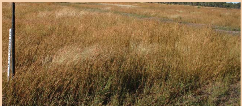
Top: Mature grader grass (2m high) April 2008 following a good wet season. Bottom: Mature grader grass (0.5m high) April 2007 following a poor wet season.