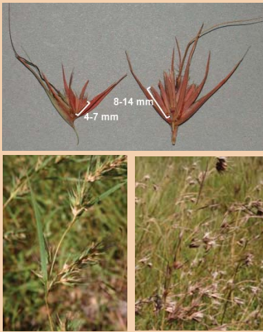
Top left: Grader grass seed head ( Themeda quadrivalvis ) - spikelets are 4-7mm long. Top right: Kangaroo grass ( Themeda triandra ) - spikelets are 8-14mm long. Bottom left: Grader grass seed head. Bottom right: Kangaroo grass seed head.