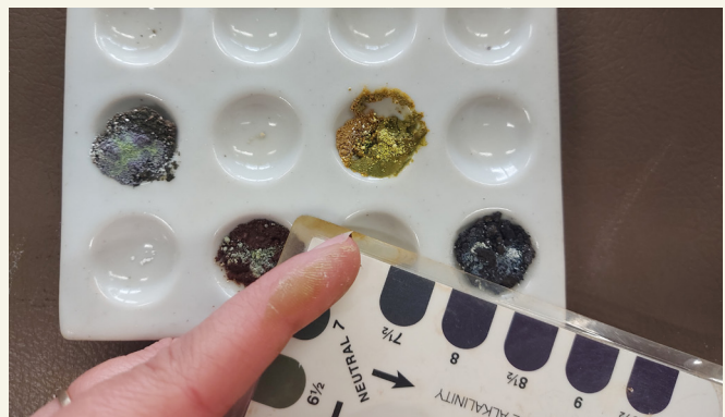
Figure 1: Carrying out a soil pH test. Compare the colour to the test card to estimate the soil pH.